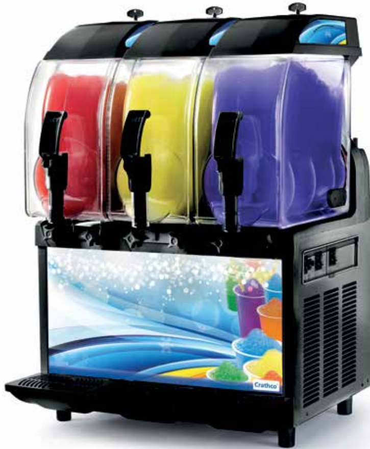
Model I-PRO 3M with light panel