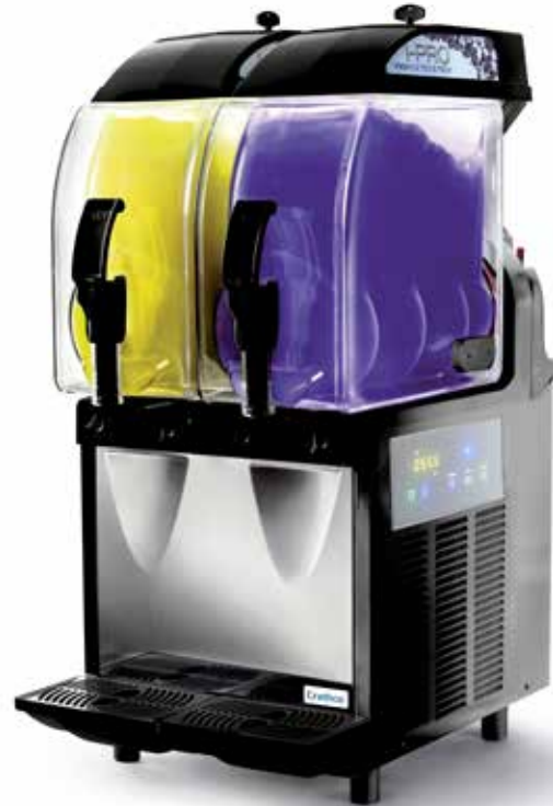
Model I-PRO 2E