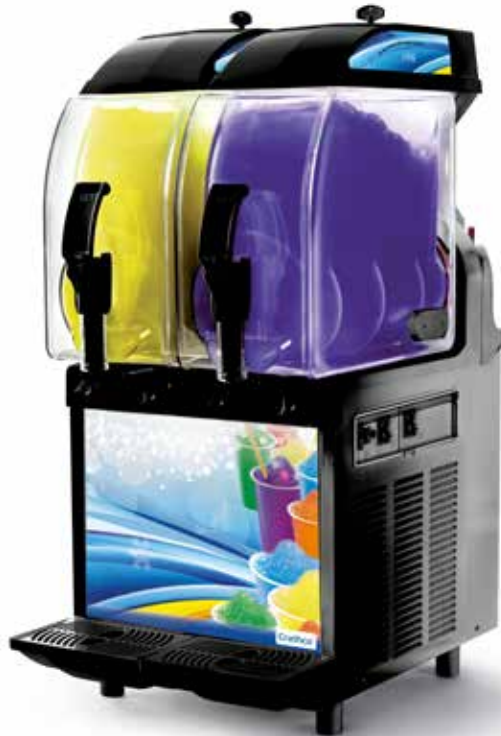
Model I-PRO 2M with light panel