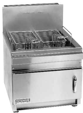
GF28 With Stainless Steel Tanks