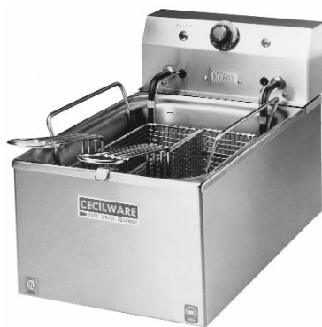
EL120 With Stainless Steel Removable Tank