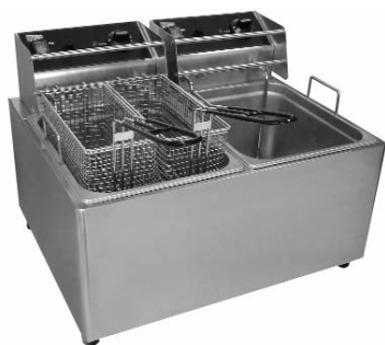
EL2X25 With Stainless Steel Removable Tank